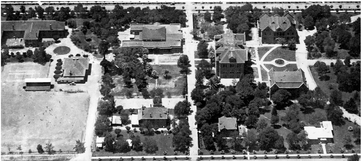
ASU Tempe Campus - 1919

ASU Tempe Campus Memorial Union Alumni Lounge MU 202