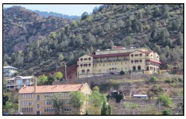
(Continued on page 7)

After an educational visit in the copper mining museum, we went on up the mountainside to the Jerome Grand Hotel. We reserved the entire hotel for our group so behavior was not an issue. The Jerome Grand has been many things over the decades, including a hospital where removed body parts were dropped down a laundry chute. It is now very popular as a wonderful back-in-time hotel, and, the largest haunted house in America. You cannot get into the Jerome Grand at Halloween.