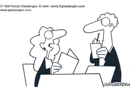
"I'm going to order a broiled skinless chicken breast, but I want you to bring me lasagna and garlic bread by mistake."