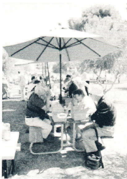
Picnic at the Olive Mill

The next stop was at Canyon Lake, to board the famed Dolly Steamboat. The boat ride was fun, with lots of time for visiting and enjoying the views, especially one of mountain sheep scrambling atop one of the cliffs.